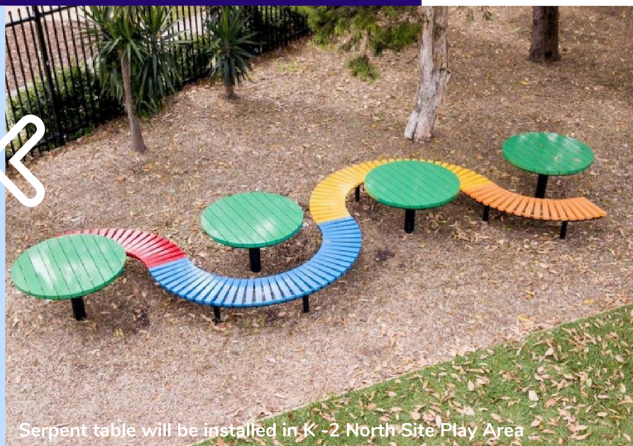
Serpent table will be installed in K -2 North Site Play Area